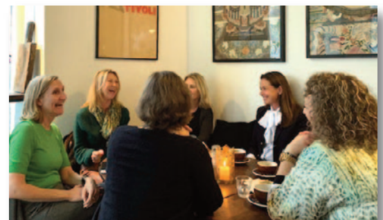
The inaugural Rich Thinking financial salon – Copenhagen, February 20, 2020

Follow me on Twitter @RichThinkingB See www.barbarastewart.ca for all research, articles and global media coverage.